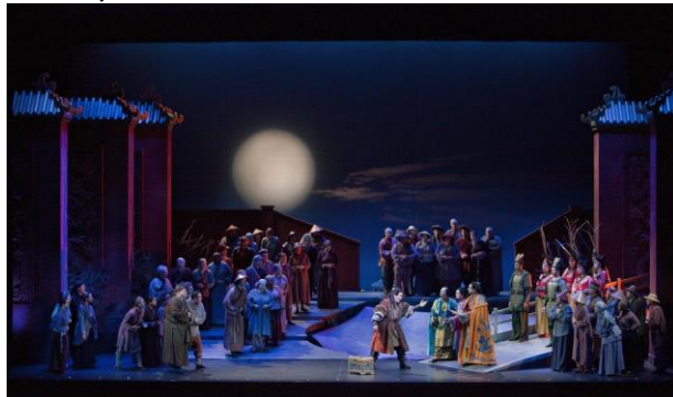
Act III, Scene 1