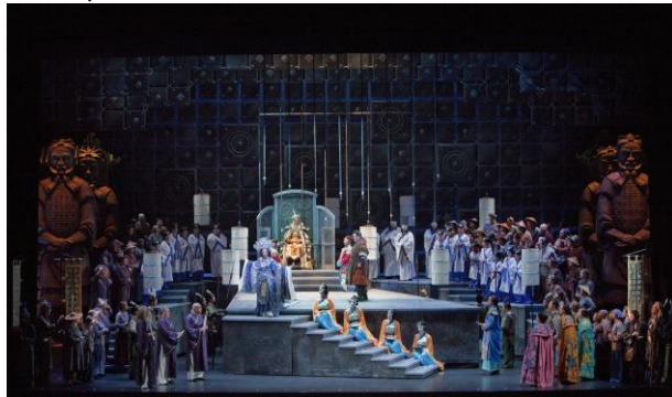
Act II, Scene 2-a