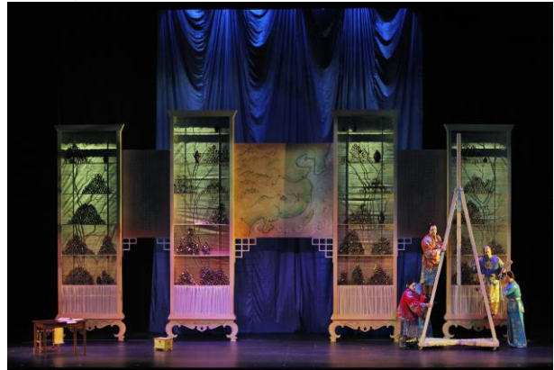
Act II, Scene 1